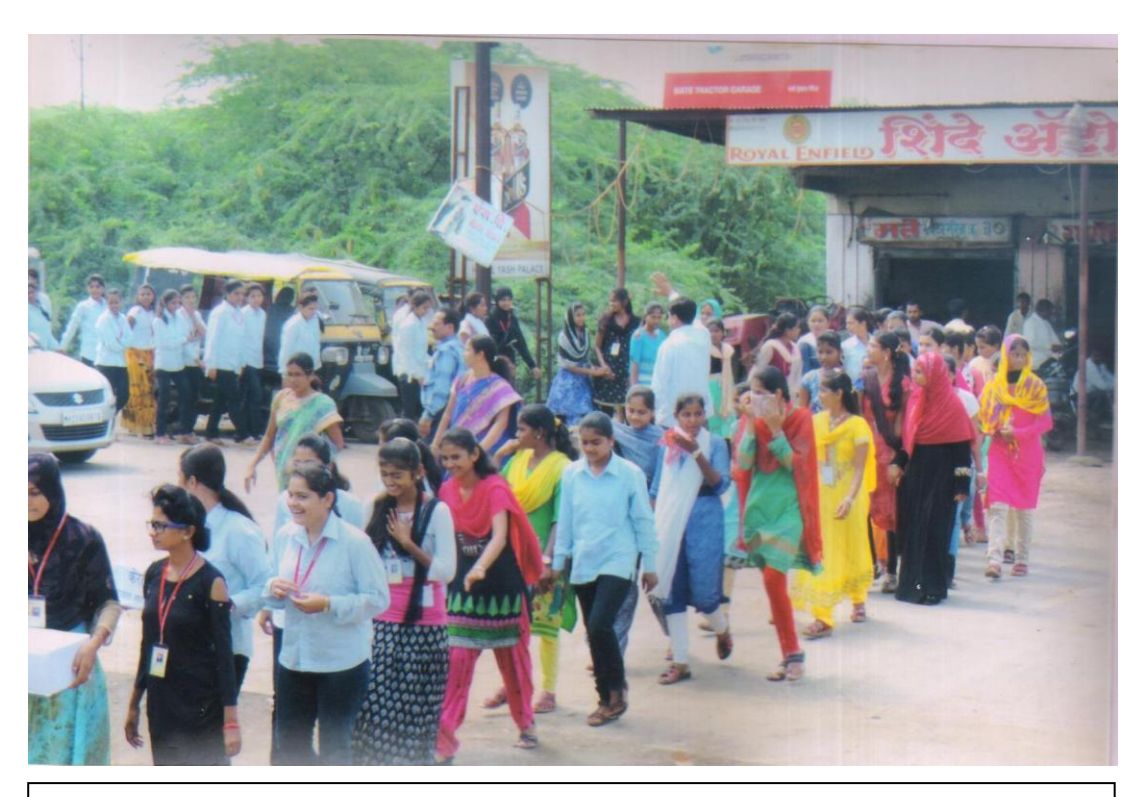
Student participating in fund raising rally to collect Kolhapur Flood Relief Fund