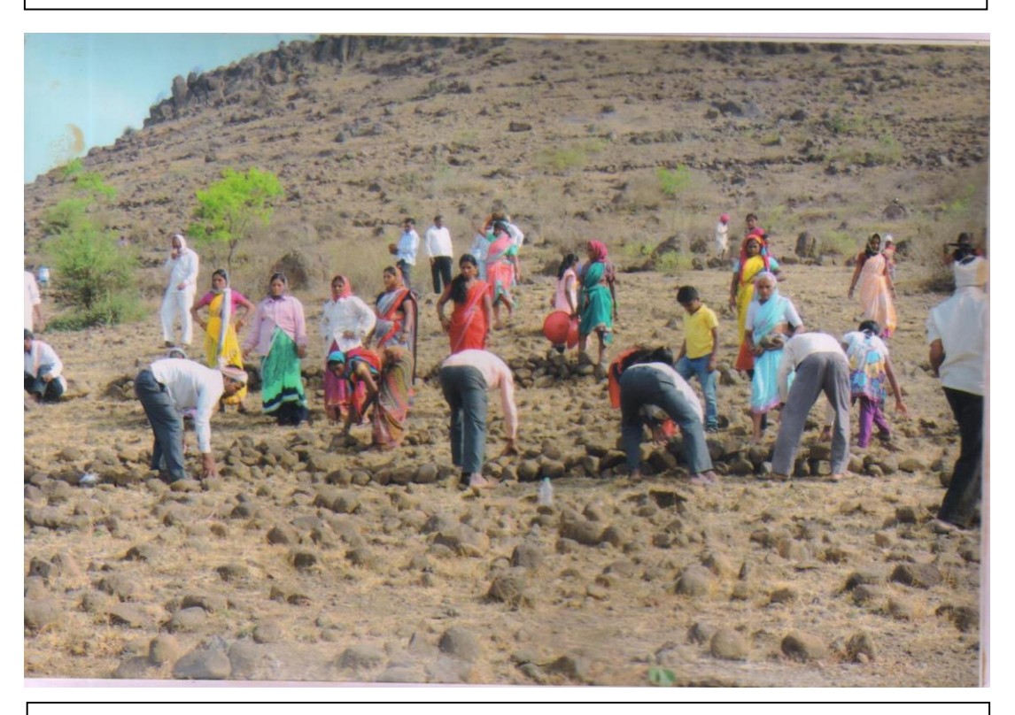
Contribution of staff in Shramdan Shibir organised in Sheri as an event of Pani Foundtion and Water Cup Competition