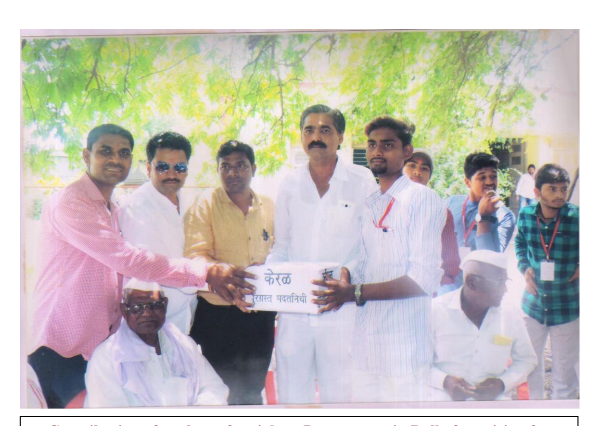
Contribution of student of sociology Department in Rally for raising for Kerala Flood Relief Fund