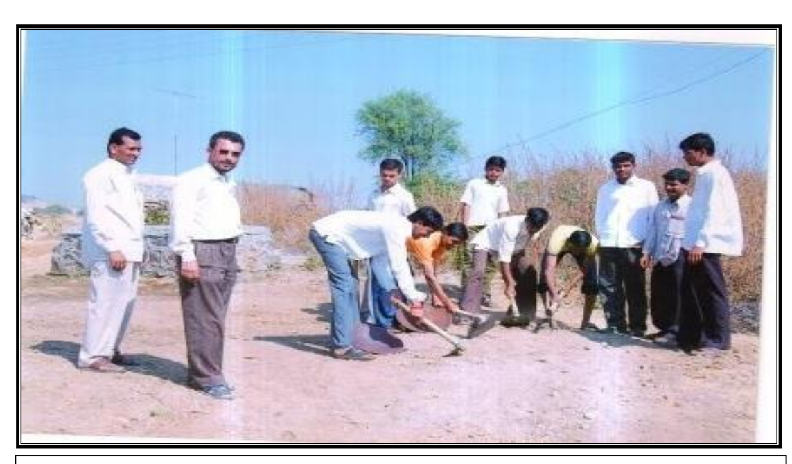
Students of the department of Sociology at Campus beautification Programme.