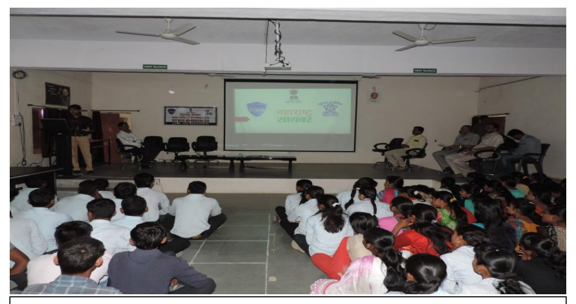
Guest Lecture Organized by Department on Cyber Crime.