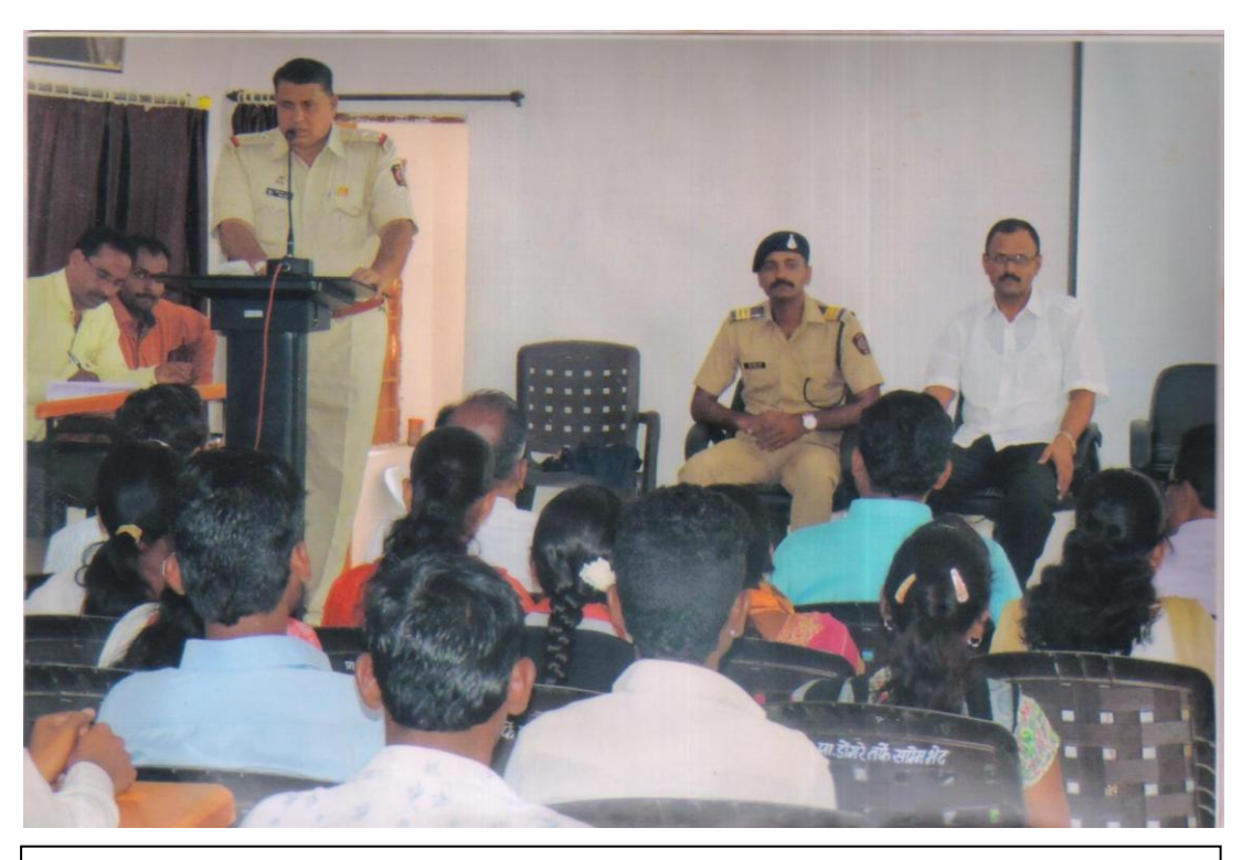
Police Officers interviewed in college auditorium for Civil Services Examinatios