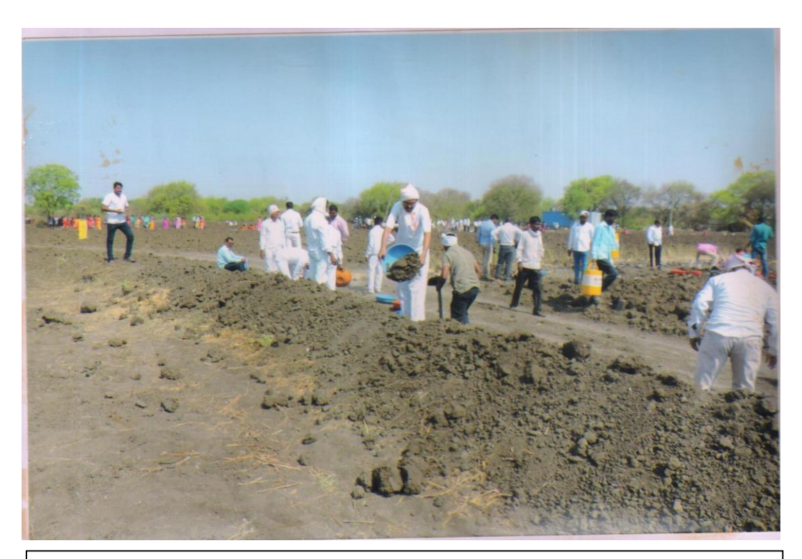
Contribution of Department of Sociology in Shramdan Shibir organised in Kasewadi as a joit venture of NSS and Kasewadi Grampaanchayat