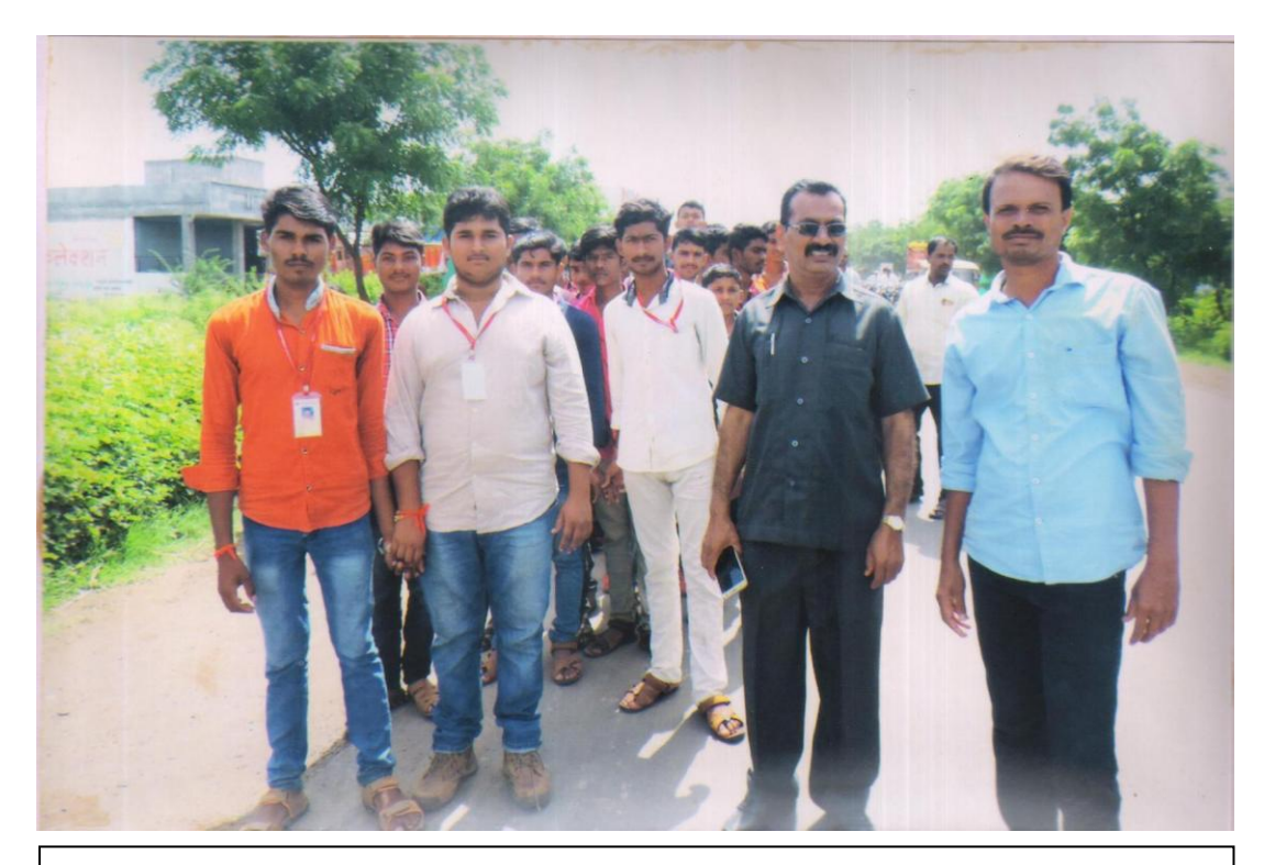
Department of Sociology organised a protest rally in Nirbhaya Gang Rape Case